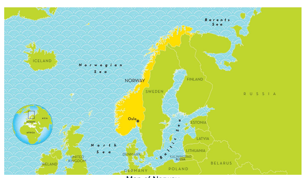
Map of Norway